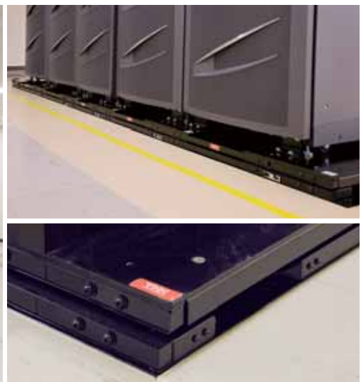
Seismically isolated JAL servers

Some people may think that making a building earthquake-proof will protect important data from being destroyed. However, the hard disk of a server or other device that is inside of a building can be destroyed in an earthquake even if the building does not suffer damage or the hard disk itself is not hit and damaged by a falling object. Furthermore, think of the opportunity loss if a server were to topple over causing the system to go down. We felt a need to introduce the most effective method possible in order to avert this type of risk.