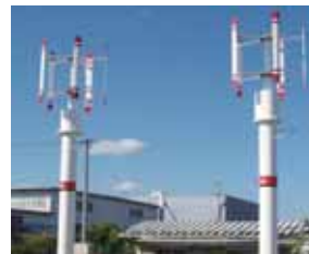
Vertical-axis wind turbine generator

There are currently around 1,800 wind turbine generators installed throughout Japan, with a total capacity of 2.44 million kilowatts. Generally speaking, there are two types: vertical-axis wind turbine generators and horizontal-axis wind turbine generators. While the vertical-axis type has a comparatively low capacity, its construction is simpler because operation is not dependent on the direction of the wind. Horizontal wind turbine generators, which are mostly high-capacity generators, have to be pointed into the wind, which requires a more complex structure incorporating advanced technology.