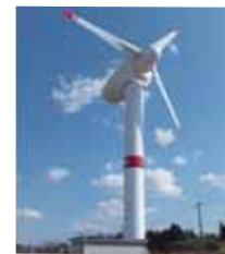
Horizontal-axis wind turbine generator