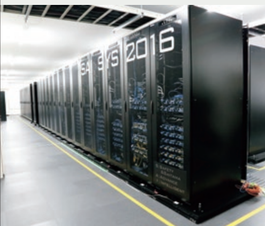
Seismic isolation devices safeguarding our servers

being in operation, because there hasn't been an earthquake in the Kanto region since their installation. THK gave us an in-depth explanation when the devices were installed, but if there were a case where additional work needed to be done, we hope to receive assistance at that time.