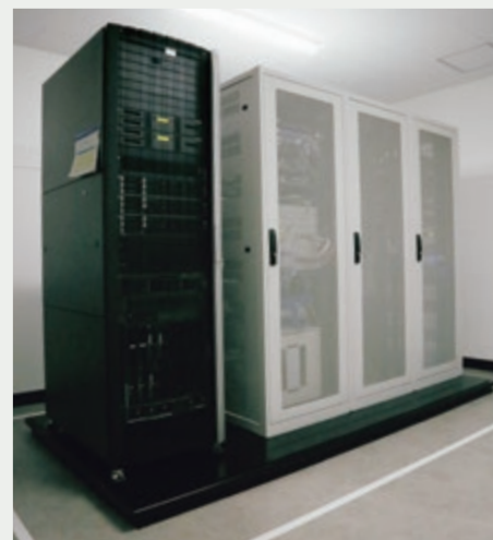
Servers in our new emergency shelter, safeguarded by seismic isolation