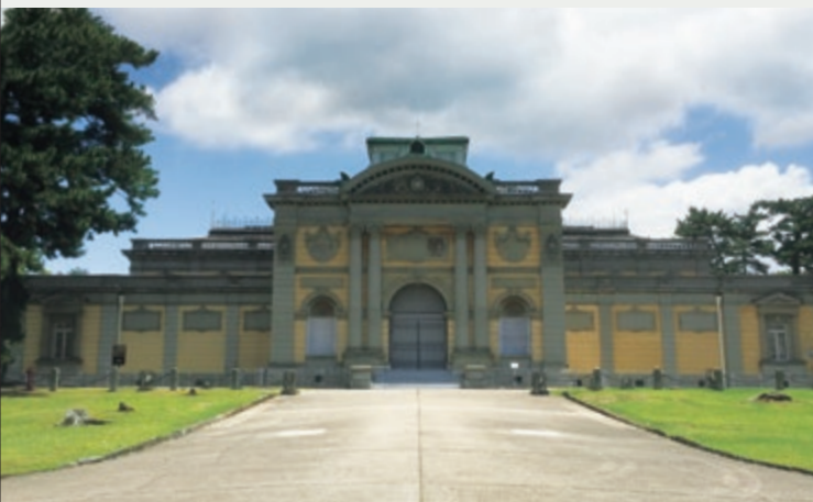
Western facade of the Nara Buddhist Sculpture Hall (Former Imperial Nara Museum Original Museum Building), designed in a Western style

In addition to providing an even better exhibition environment for our guests, we need to create a safe storage environment for our artifacts. Seismic isolation is an important step in making this a reality.