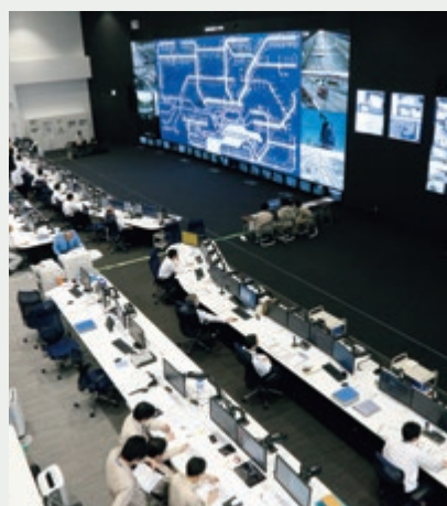
Control room with seismic isolation devices in the floor