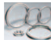
Cross Roller Rings