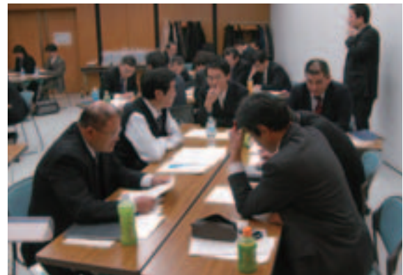
▲ Compliance Panel members take part in a study session.

* e-learning: The use of educational materials available via computer