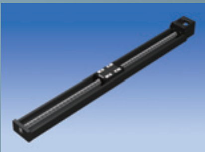
LM Guide Actuators: SKR55/65

This model's service life has been extended to around six times that of existing products by the adoption of a double-nut system. Besides enabling high-speed operation due to its tangential pickup system, the fitting of the caged ball structure has realized long-term maintenance-free use and low-noise, smooth operation.