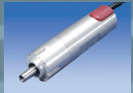
Vibration Actuator: QBL

The Model CCR actuator facilitates independent linear and circular control. Its compact design with built-in encoder has realized device downsizing and high tact levels and also resulted in a product that has enabled the miniaturization of the pick-and-place unit and higher operating speeds of various devices.