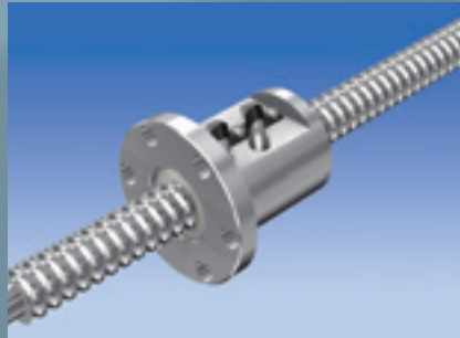
Precision Ball Screw: BIF-V

By expanding the block variations in miniature caged ball LM guides, we are now able to offer the caged ball structure across our complete miniature LM guide product lineup and thus meet a wide range of customer needs.