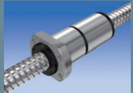
Caged Ball High-Speed Ball Screw: SBKN

In our precision ball screw range, we developed the Model BIF-V. This product delivers superior performance due to such features as its low noise—achieved by the adoption of a new circulation system that picks up the ball in the tangential direction—its low torque variation and its high speed, which is around twice that of existing products.