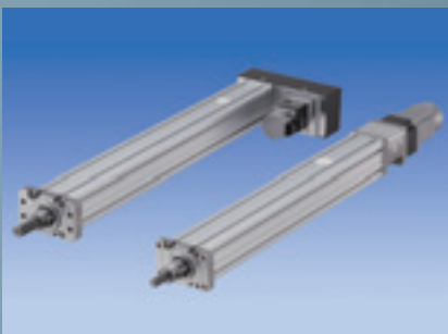
Press Series: PCT

This handheld vibration actuator enables high-speed reciprocating motion. Specialized for vibration applications in magnetic circuits and bearing structures, the Model QBL's simple, easy-to-use configuration makes it the ideal product for all devices that utilize vibration.