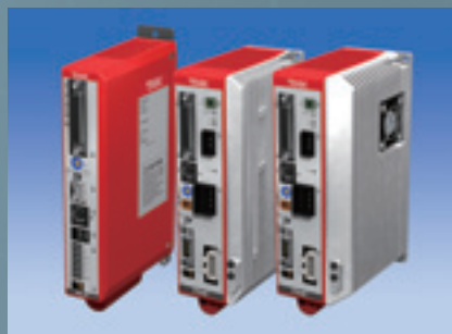
Controller Series: TLC/THC

This is a cylinder-type electric actuator that uses ball screws. By replacing a pneumatic cylinder, this model realizes high tact levels, increased precision and multipoint positioning and can contribute greatly to improving the productivity of customer equipment.