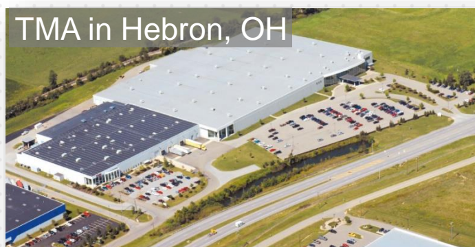
TMA in Hebron, OH

Our Quick Ship Program is made possible by our 400,000 square foot manufacturing facility in Hebron, Ohio : THK Manufacturing of America (TMA). TMA produces the majority of THK linear motion guides sold in North America, and it's this industry-leading domestic manufacturer that allows us to keep our most popular products in stock within the United States. Additionally, recent automation efforts undertaken by TMA have increased our production capabilities even more.